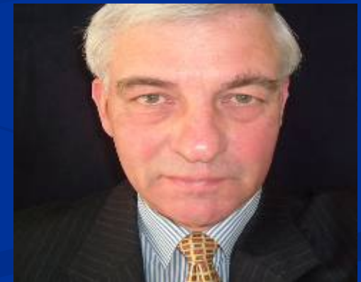
Air Commodore Alan Waldron